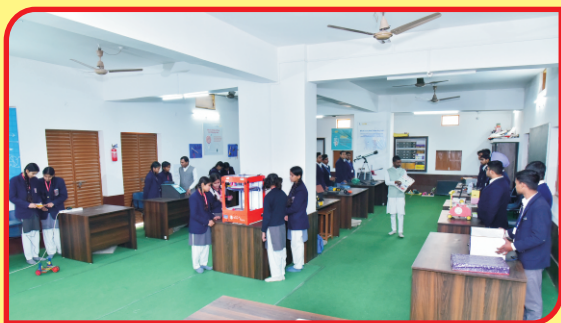
Atal Tinkering Lab