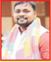
आशीष कश्यप क्षेत्रीय मंत्री, भा.ज.पा., युवा मोर्चा