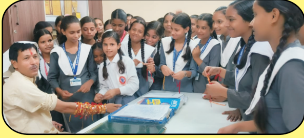
रक्षाबंधन पर्व पर प्रधानाचार्य जी को रक्षा सूत्र बांधती हुई बहनें।